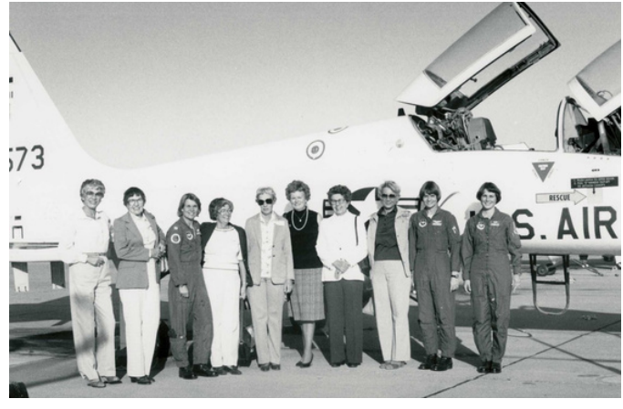
Gen 1 pilots with some members of the first USAF Undergraduate Pilot Training class of Gen 2 pilots

In simple terms, the WASP legacy can be stated as "they did their part for the war effort." However, today's women military aviators view the WASP legacy as so much more. During the 1940s, the WASP proved women could fly any aircraft in the inventory and could do so under adversity: battling airworthiness of aircraft, environmental conditions, or just dealing with acceptance in military aviation units.